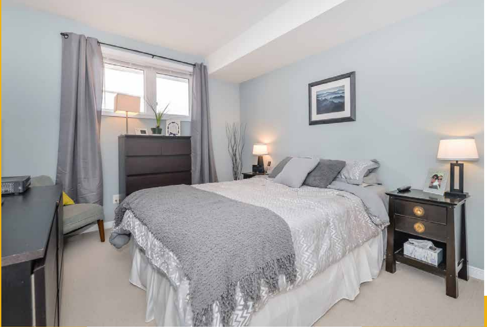
Master Bedroom Retreat