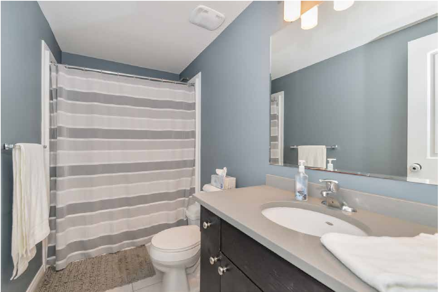
M ain B athroom