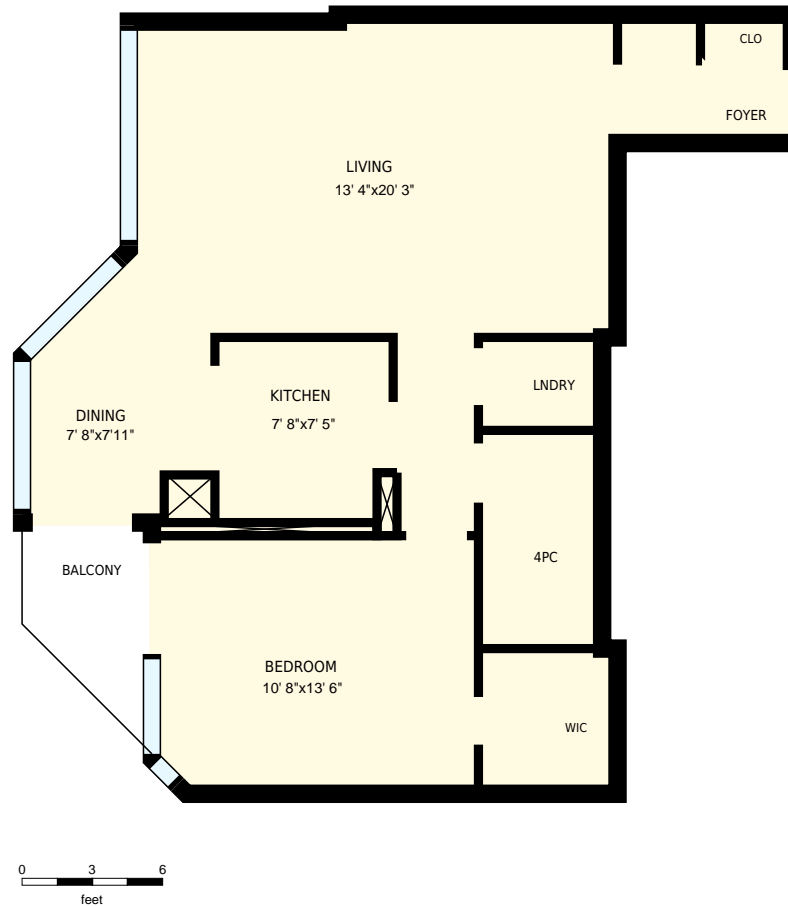
Main Floor Exterior Area 850 sq. ft.

Total Exterior Area Above Grade 850 sq. ft.