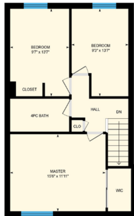
2nd Floor Exterior Area 704 sq. ft.