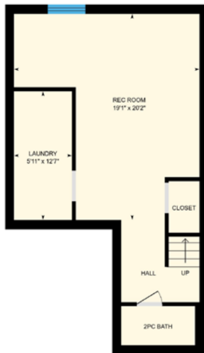
Basement (Below Grade) Exterior Area 581 sq. ft.