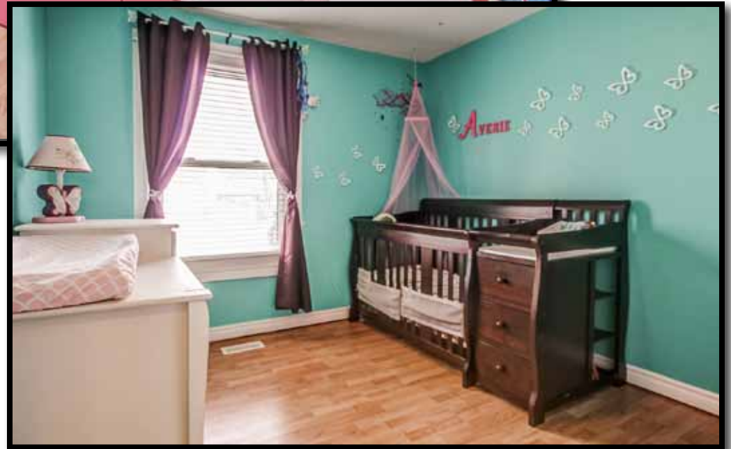
Bedrooms 2 & 3