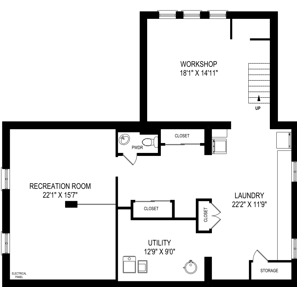
LOWER LEVEL - 1383 SQUARE FEET